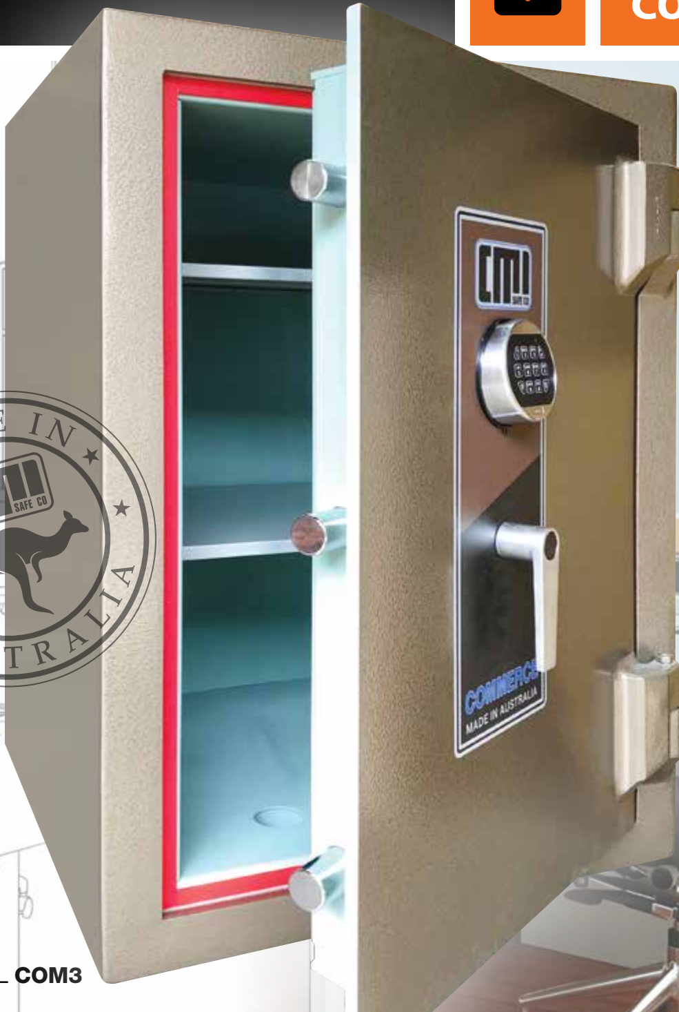
■ MODEL COM3