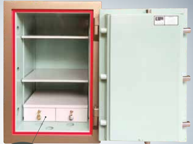
■ MODEL COM3