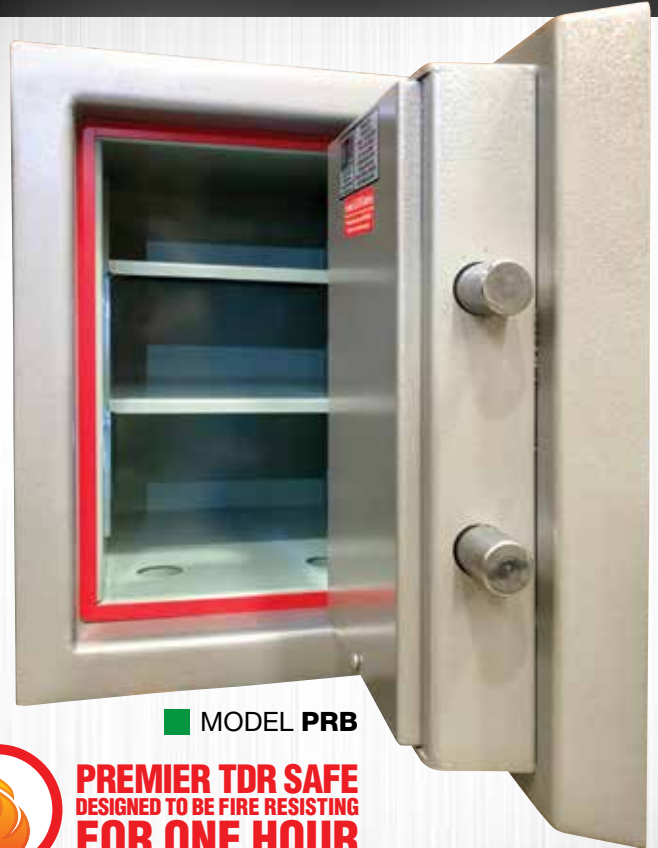
■ MODEL PRB