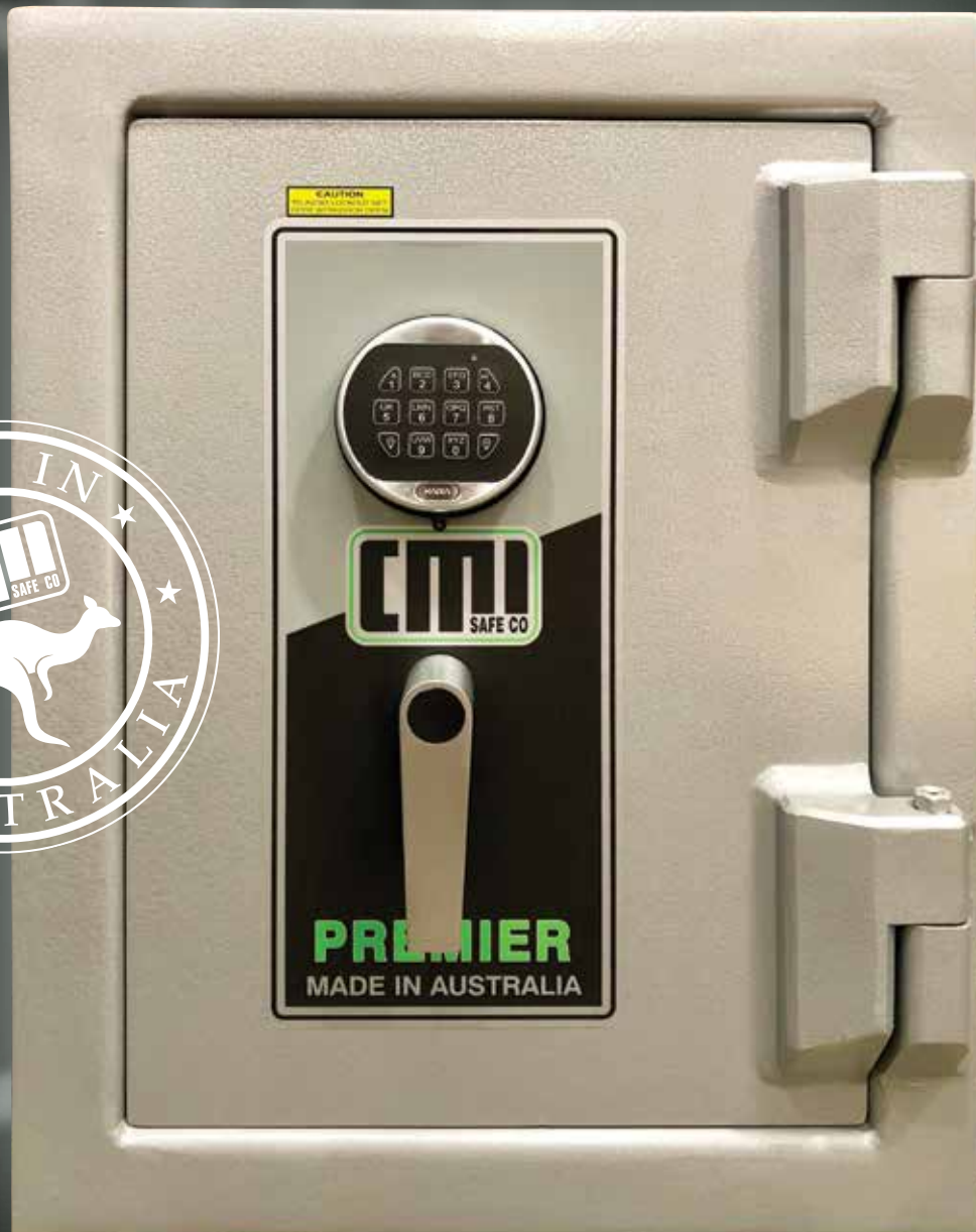
■ MODEL PRB