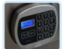
Digital Upgrade (CL2)