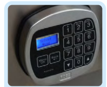
Digital Upgrade (CL2)