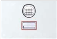
E (R2 or R3)