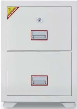
DFC 2200K with Keylock