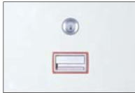
K (Key Lock)