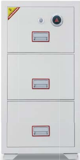
DFC 3200KC with Key Lock & Changeable Combination Lock