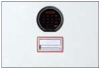
TFL (Touch Pad & Finger-print Lock)