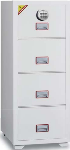
DFC 4200E with Digital Lock R2