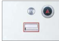
KC (Key Lock & Changeable Combination Lock)