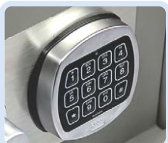
Digital Ross 1000