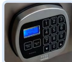
Digital Ross 100 L02 & L22